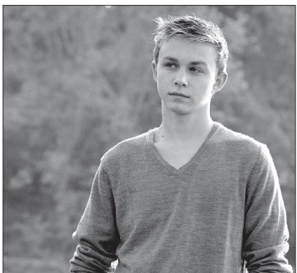
VHS BOYS' FASHION SURPRISINGLY STYLISH. SEE PAGE 11