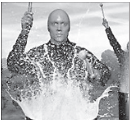
THE PARAMOUNT THEATRE HOSTS THE BLUE MAN GROUP. SEE PAGE 12