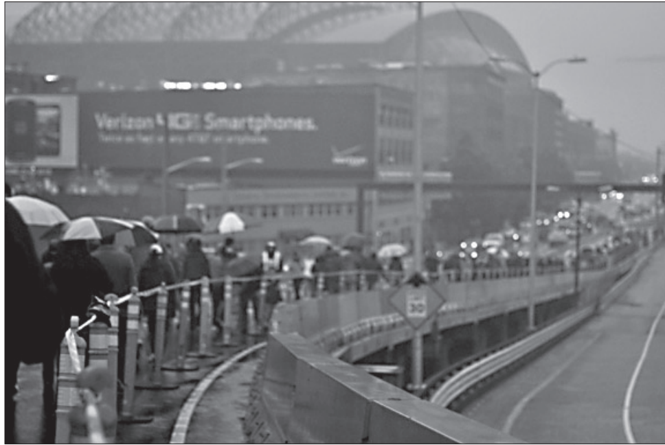
Thousands of Seattleites parade down the doomed Alaskan Way Viaduct before it is destroyed